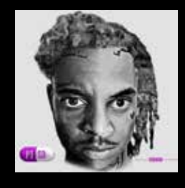
D- Block Europe - PTSD